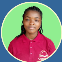
Horline African Science A.