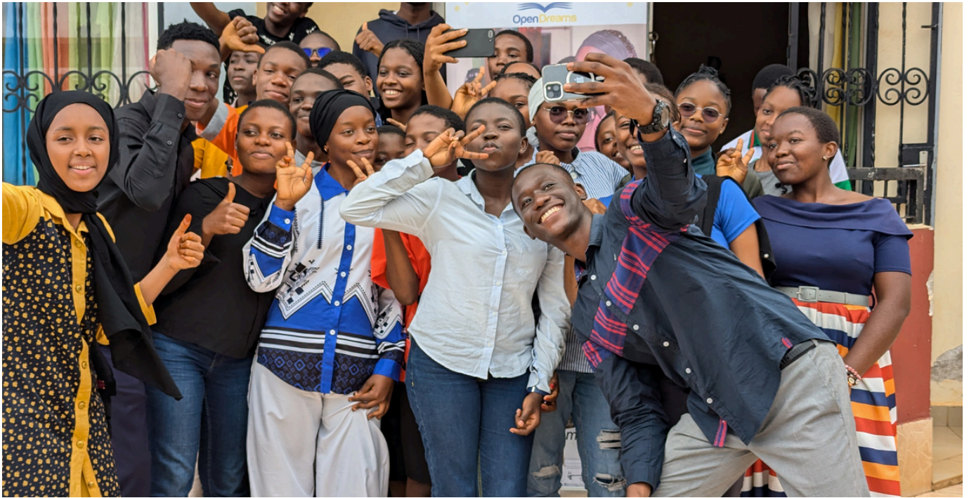
Open Dreams Pre-Scholars 2024 - The Batch of Triumph (with some mentors)

It is with a very full heart that I open our 10th Year Anniversary brochure to you with the deep gratitude we have for this incredible organization and the amazing scholars, volunteers, and mentors within it. Just over 10 years ago, the idea that we could have brilliant Cameroonian students on full scholarships at prestigious universities all over the world seemed like a far-fetched dream. But today, that dream is a reality. It all started with a conversation in 2013 and a simple idea - to help ambitious students from Cameroon, especially those from lower-income backgrounds, study alongside the world's brightest students on full scholarships.